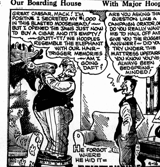
Our Boarding House With Major Hooples