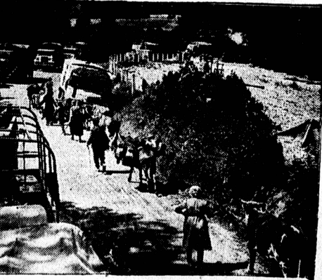
THE ROAD BACK. While Allied transport vehicles lumber forward to the front, French refugees, their worldly belongings with them, move back to their homes and villages. Awaiting them in their liberated country is a host of social and political problems, still unsolved and whose roots lie deep in the history of the French Republic. "Inside France", latest National Film Board release in its World In Action series, presents a close analysis of those problems, discusses the forces at work upon which the shaping of the peace in France may finally depend.

TEAM NO. 96 TEAM NO. 97 TEAM NO. 98 TEAM NO. 99 TEAM NO. 100