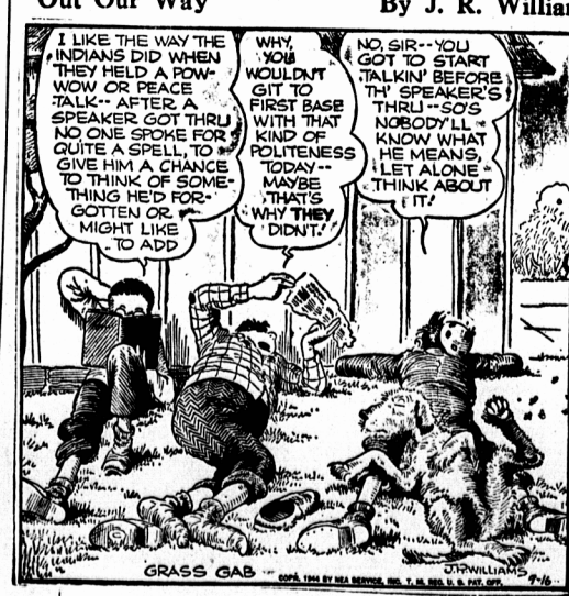
Out Our Way By J. R. Williams