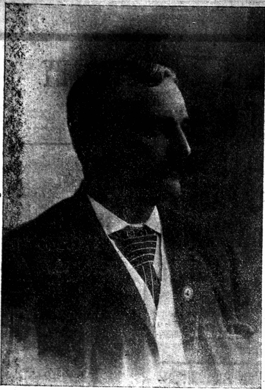
MAYOR WARBURTON, Who welcomed the visitors to the City at the Exhibition yesterday afternoon.