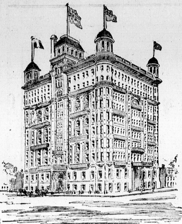
FORESTER'S BUILDING, Toronto.