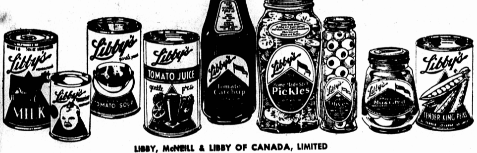
LIBBY, McNEILL & LIBBY OF CANADA, LIMITED Chatham - Ontario

Today Libby's enables you, at little cost, to enrich your table with a wide variety of nourishing, tasty foods—some of which were quite unknown 75 years ago and all of which consistently provide the finest possible quality.