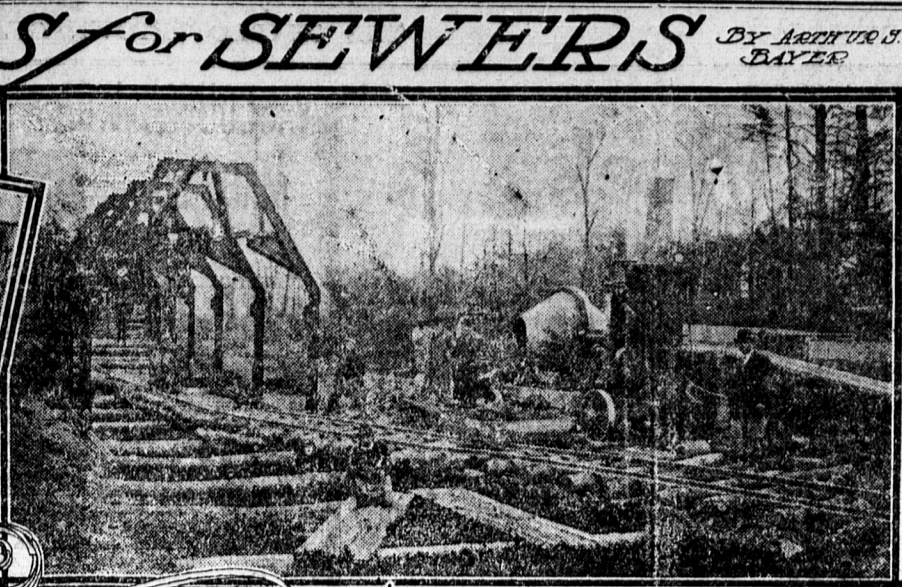
Overhead Tramway A New Method for Carrying Away Excavated Material