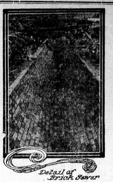
Detail of Brick Sewer

A BILLION OF DOLLARS is the amount civilized man has set aside for placing effective sewers under the great cities of the modern world.