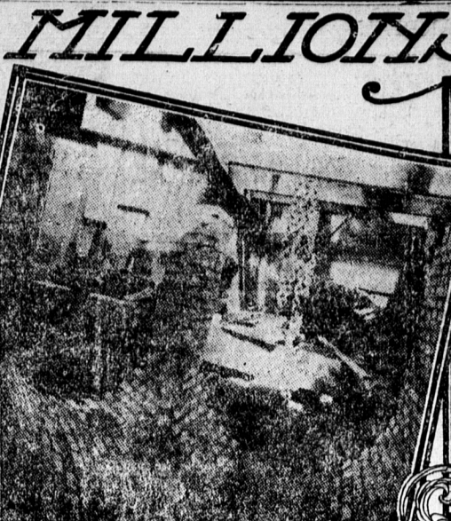
A Delicate Bit of Construction Main Sewer Branching Out