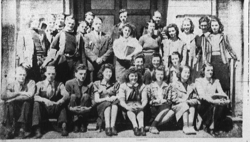
P. W. C. SECTION A—SECOND YEAR