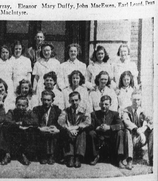
P. W. C. SECTION C—SECOND YEAR.