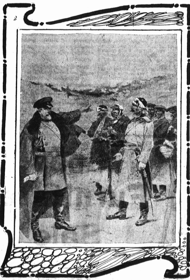
RUSSIAN SORTIE PARTY AT PORT ARTHUR.

Herat is taken. The Russians are led to victory by General Skobloff, newly resurrected for the occasion. France lends a hand. Lord Cromer is