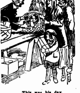
This was his day.