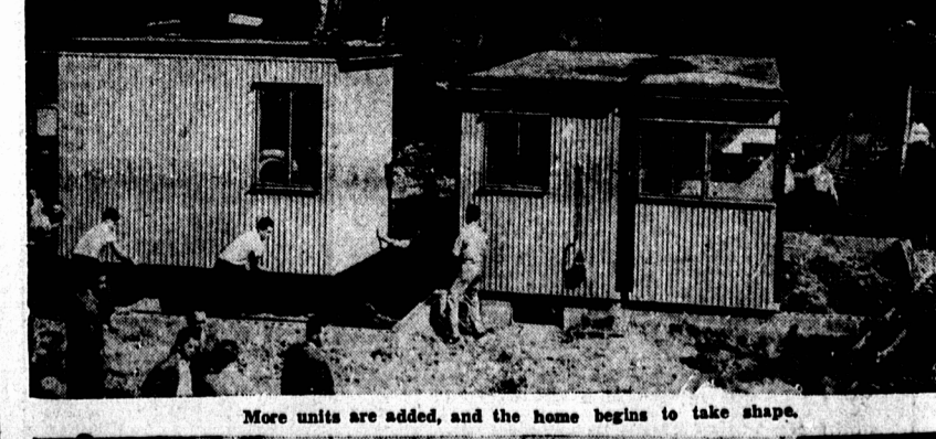
More units are added, and the home begins to take shape.