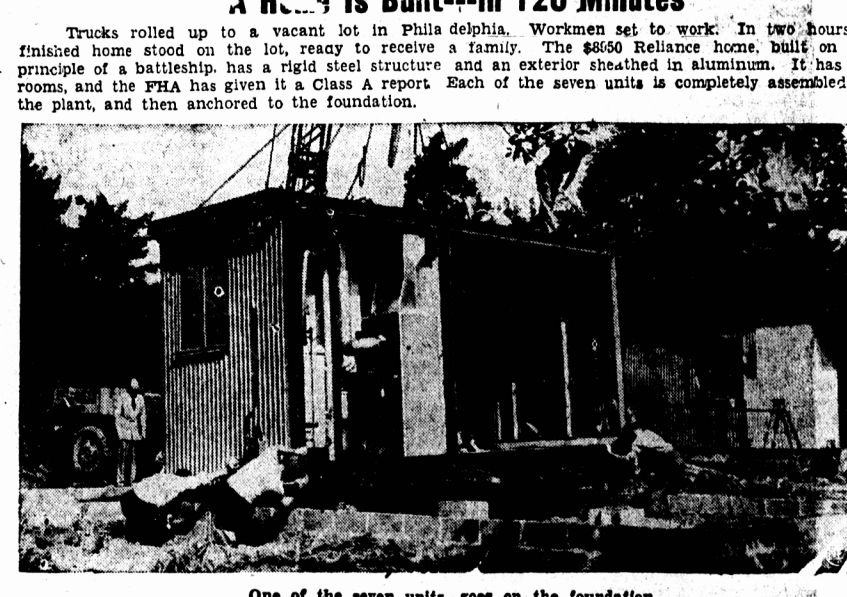
One of the seven units goes on the foundation.

A Home Is Built—in 120 Minutes Trucks rolled up to a vacant lot in Phila delphia. Workmen set to work. In two hours, a finished home stood on the lot, ready to receive a family. The $2850 Reliance home, built on the principle of a battleship, has a rigid steel structure and an exterior sheathed in aluminum. It has six rooms, and the FHA has given it a Class A report. Each of the seven units is completely assembled at the plant, and then anchored to the foundation.