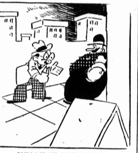
WHAT IT WOULD DO

Prohibition Advocate: Could sink the whole whiskey to the bottom of the sea what would it do for the people of this land?