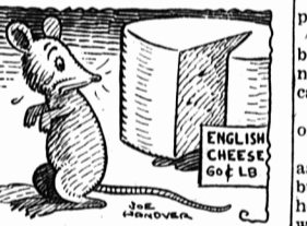
Sad plight of patriotic mouse (of Chiquita) who won't eat English cheese!