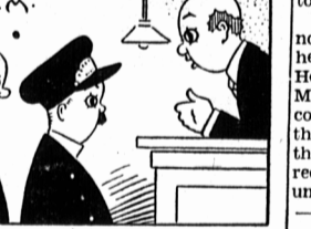
ASSAULT AND ARSON Magistrate: I see this man has assault and arson opposite his name. What did you arrest him for, officer? Officer: For striking a match, your honor, and causing a fire.