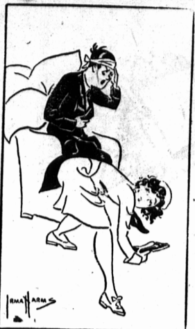
No sensible girl will nurse a grouch.