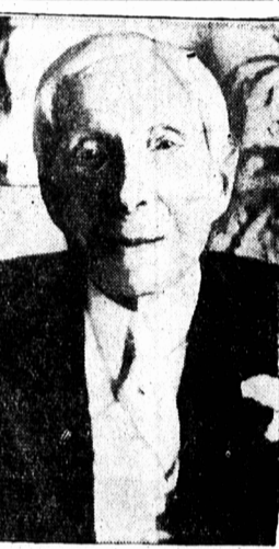
JOHN D. ROCKEFELLER, SR.

ORMOND BEACH, Fla., May 23—John D. Rockefeller, sr., founder of one of the world's most colossal private fortunes and benefactor of humanity, died in his 98th year today at his winter home, "The Casements."