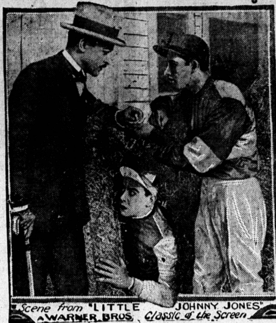
Scene from "LITTLE JOHNNY JONES" WARNER BROS. Classic of the Screen

A wonderful race horse comedy drama coming to the Prince Edward Friday.