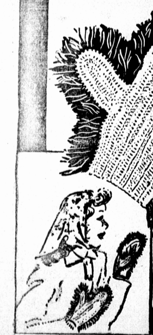
DESIGN NO. 1233

The girls of the teen age will be delighted to own these adorable mittens crocheted of one color and the fringe is made of two colors. They are ideal for sportswear. Pattern No. 1233 contains list of materials needed, illustration of stitches and complete instructions.