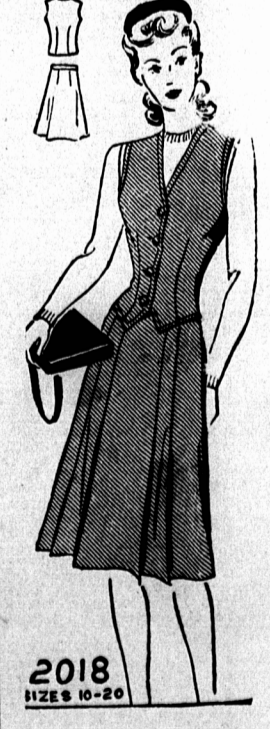
2018 SIZES 10-20

The inquisitive old lady was questioned by the battered man about his appearance. "Just had a fight with the miasma he explained. "Liquor?" "No—she looked me as usual."