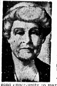
Answer— No other woman in the world has such a good opportunity to marry as the business woman, because she is thrown to get in her daily work and it does so often that there is always a big turnover in the female employees in every establishment where the two sexes mingle.

Platinum and uranium have also been obtained from the same source.