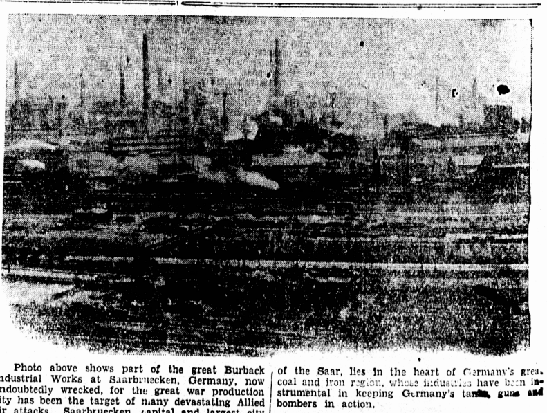
Photo above shows part of the great Burback Industrial Works at Saarbruecken, Germany, now undoubtedly wrecked, for the great war production city has been the target of many devastating Allied air attacks. Saarbruecken, capital and largest city of the Saar, lies in the heart of Germany's great coal and iron region, whose industries have been instrumental in keeping Germany's tanks, guns and bombers in action.