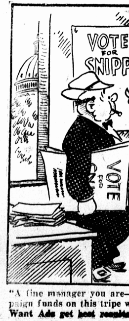
"A fine manager you are—wastin' all of our campaign funds on this tripe when you know Guardian Want Ads get best results!"