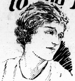
Mother is the Health Doctor

The dirt and grime, the possible infection that is a part of the daily playtime—these have no terrors for the millions of kiddies whose mothers have learned to know and prize Lifebuoy Soap.