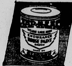
WEARS LIKE IRON

Try out for yourself the superiority of the new Jap-a-lac Paint. By rubbing between finger and thumb, get the smooth feel of it; that is the proof of fine grinding of the base materials.