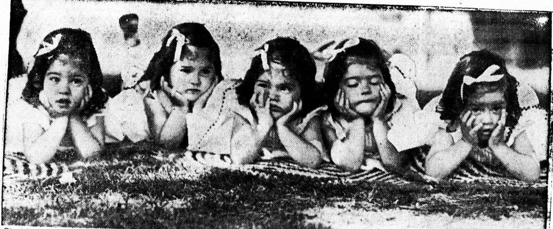
Stretched out on their little rugs in the play-yard of the Dafoe Nursery, the Dionne quints enjoy a sunny summer day at Callander.