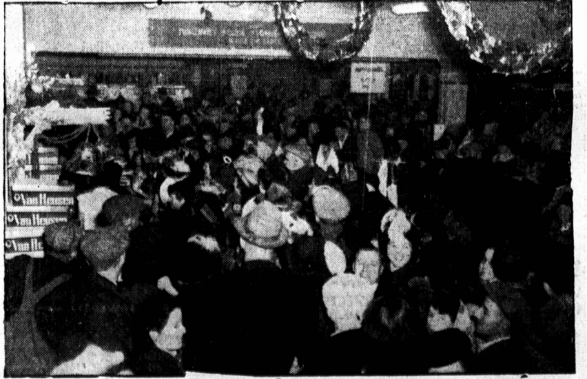
The scene depicted above shows the big rush in the Men's Furnishings Department of Smallman's, Summerside, several days ago, at their Dollar Days Sale when a popular line of shirts was placed on sale at $1.00 each and only one to a customer.