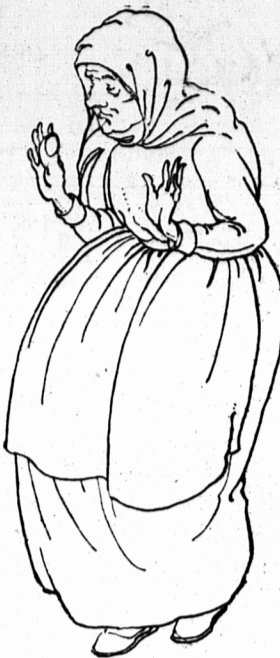
THE THIRD SPINNER

Today you will read one chapter of the story of "The Three Spinners." Have you been following this fairy tale? If you have you will soon have a whole set of "Three Spinners" paper dolls.