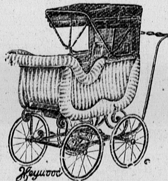
$21.50 to $50.00

Big comfortable reed Pullman carriages—in brown—grey—white and natural; $21.50, 24.00, 27.50, 31.50 up to 50.00.