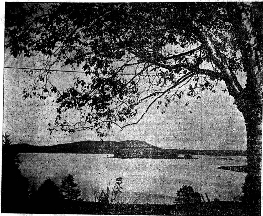
ST. CROIX ISLAND.

America, are in the vicinity of St. Stephen. An important point to be considered by many who would desire to attend the