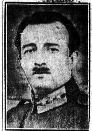
President Ahmed Zogu of Albania is shortly to be elevated to the royal throne of his country...

Charlottetown Guardian Two Cents Morning Guardian, Founded 1897