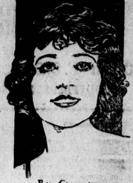
Betty Compson Paramount Picture To Have and to Hold A George Fitzmaurice production

AT THE PRINCE EDWARD Wednesday and Thursday, January 24th and 25th