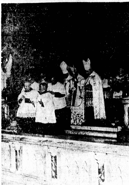
The newly consecrated Bishop leaving the Sanctuary at the close of the ceremony.