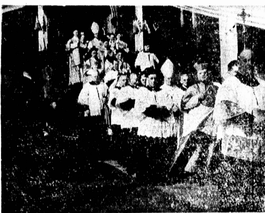
Procession leaving the Bishop's residence for St. Dunstan's Basilica.