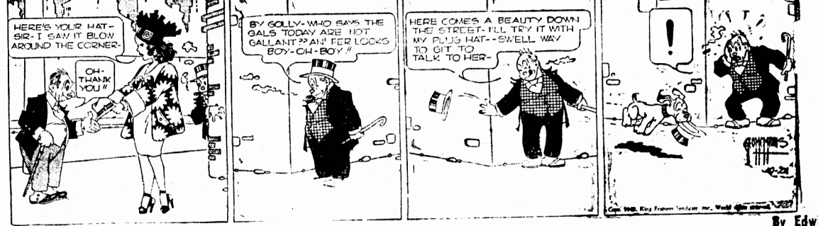
TIPPY AND "CAP" STUBBS