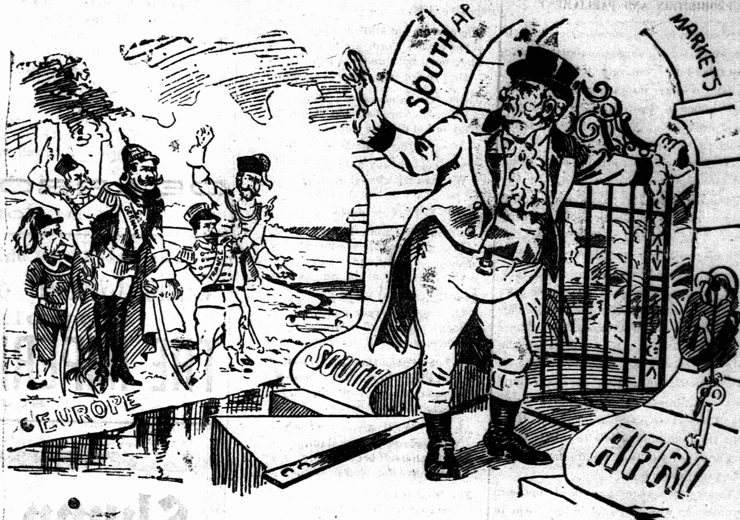
EXPLANATION WANTED. JOHN BULL.—When I open a door I leave it open freely to all of you. I have given you about all the foreign trade you have! What are you mad about?

He also had letters from General Weyler, General Lawton and others. He could speak five languages.