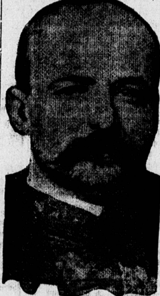
COUNT STEPHEN TISZA.