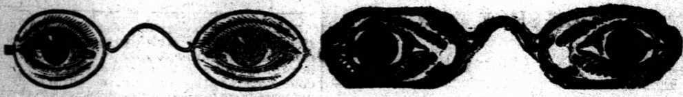
Shows Properly Fitted Frame