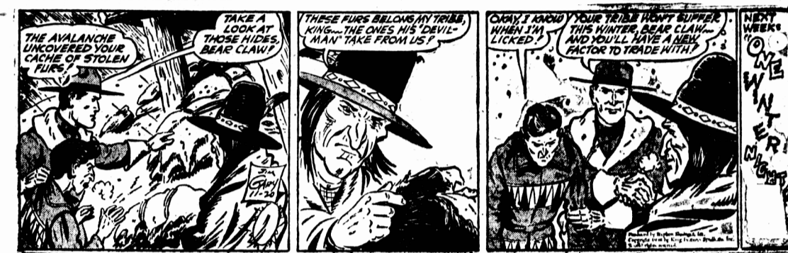
By Zane Grey