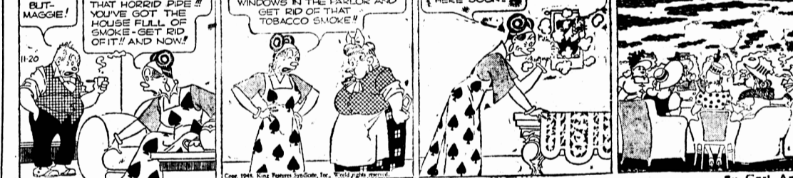
By George McManus