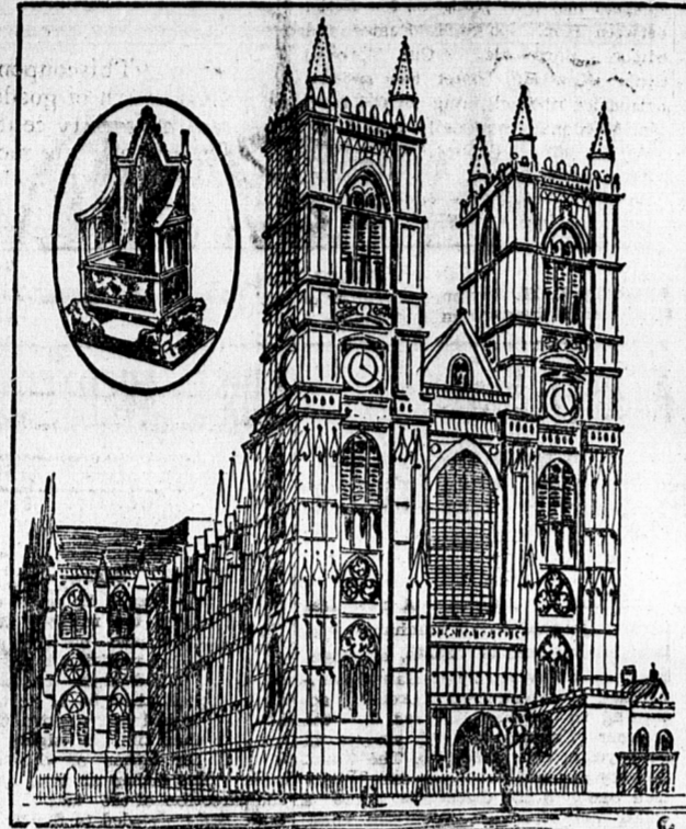
WESTMINSTER ABBEY, SCENE OF THE CORONATION.

Sarsaparilla is unquestionably the greatest blood and liver medicine known. It positively and permanently cures every humor, from Pimples to Scrofula. It is the Best Blood Medicine.