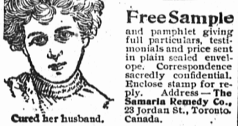
Cured her husband.

Free Sample and pamphlet giving full particulars, testimonials and price sent in plain sealed envelope. Correspondence secretly confidential. Enclose stamp for reply. Address—The Samaritan Remedy Co., 23 Jones St., Toronto, Canada.