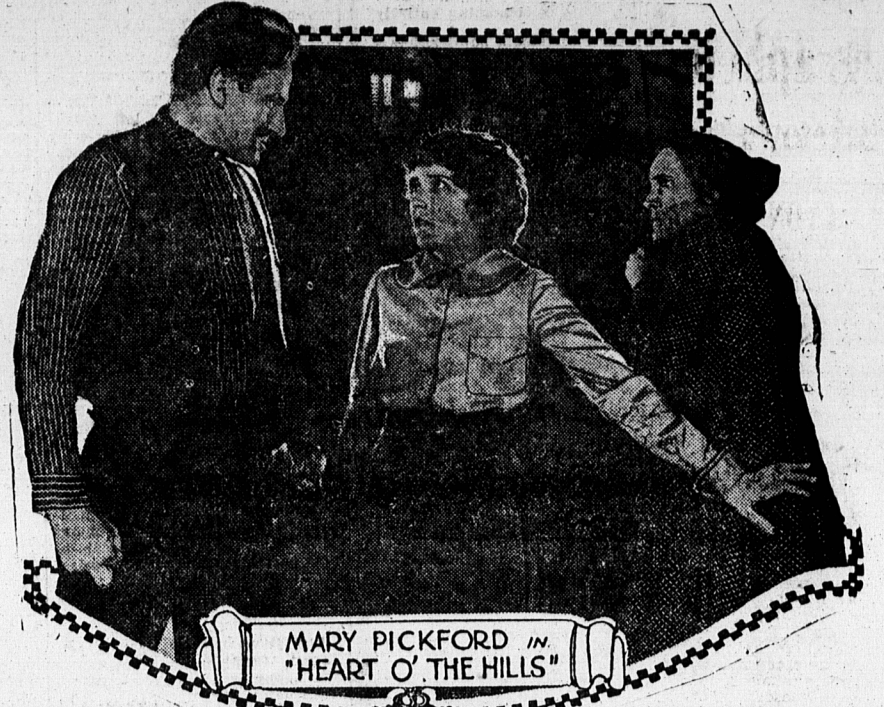
MARY PICKFORD IN "HEART O' THE HILLS"

You'll fall in love with Mary Pickford all over a gain. This story of her loyalty to "Pap" in the Feudists Battles of the Kentucky mountains.