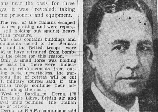
MAY GET LONDON POST Norman Armour, career diplomat and now U.S. ambassador to Argentina, has been mentioned in informed Washington circles for the vacant post of U.S. ambassador to Great Britain. He was formerly U.S. minister to Canada. He is a son of the famous U.S. meat packing family.