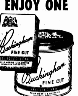
ROLLS BETTER CIGARETTES