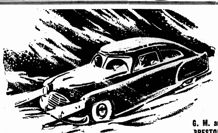
G. M. and PRESTONE

JOIN THE CANADIAN ARMY ACTIVE FORCE NOW!