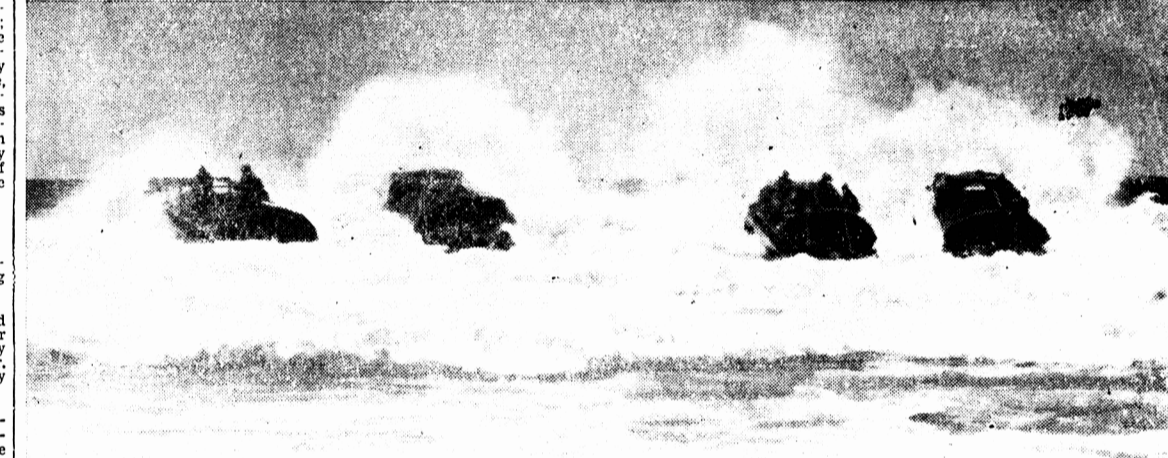
ARMY DUCK-TRUCKS HIT THE SURF. A quartet of the Army's newest amphibians—a 21-ton truck that travels with equal facility on land or sea—hits the surf somewhere on the Pacific coast, headed out to sea to make rendezvous with other units during recent maneuvers. Officially known as DUKWs, the sea-going trucks have been dubbed, naturally enough, "ducks." Those above it are attached to the Amphibian Engineers of the 3rd Engineer Special Brigade.