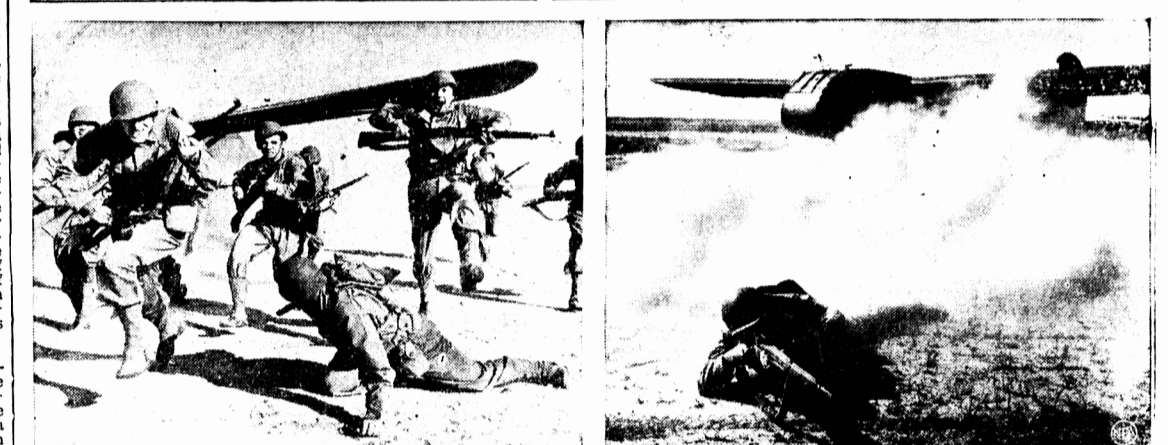
Fifteen men on a deadly mission—that's the "cargo" carried by each of the Army's flying freight cars. These gliders, now mass produced and engaged in constant training, will spearhead the Allied airborne attack in coming invasions. Here maneuvering shock troops march into their glider; a twin-motored bomber tows it off the ground; then the gliders are cut loose to swoop to earth as they near the attack target. Once on the ground, the "silent soldiers" break their silence and leap from their gliders with war cries on their lips. Protected by smoke screens, they charge to the attack or fire from prone positions on maneuvers that are preparing these glider troops for attack on enemy airfields and positions.