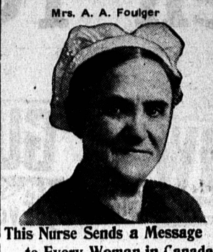
This Nurse Sends a Message to Every Woman in Canada