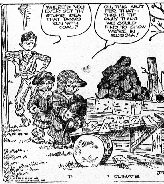
By George McManus

Seven beavers saved the Manitoba government $80 by building a dam just where engineers planned it on a creek near Lake Winnipeg.