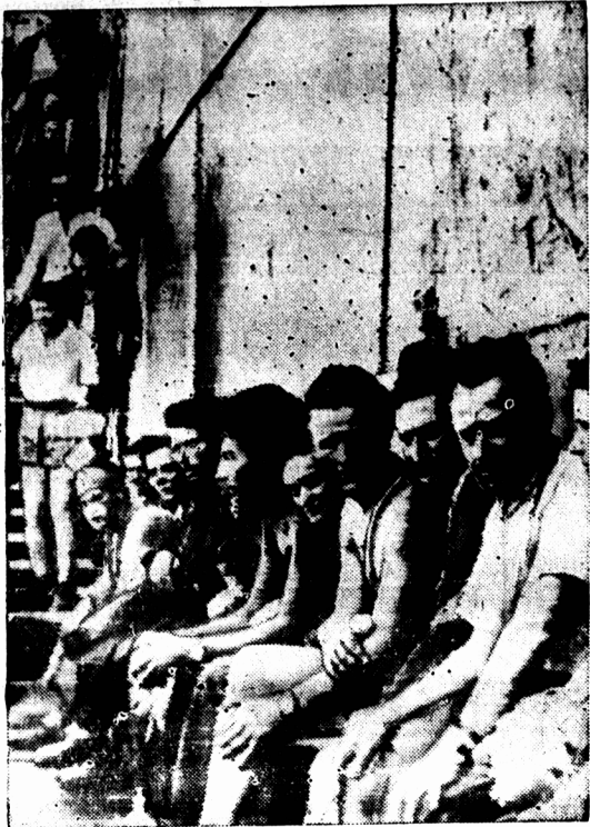
Denied permission to enter Palestine, these Jewish refugees wait patiently aboard a British transport at Famagusta, Cyprus, to be transferred to the island. More than 2,000 refugees have been sent to Cyprus. Deportation order set off riots in Palestine.