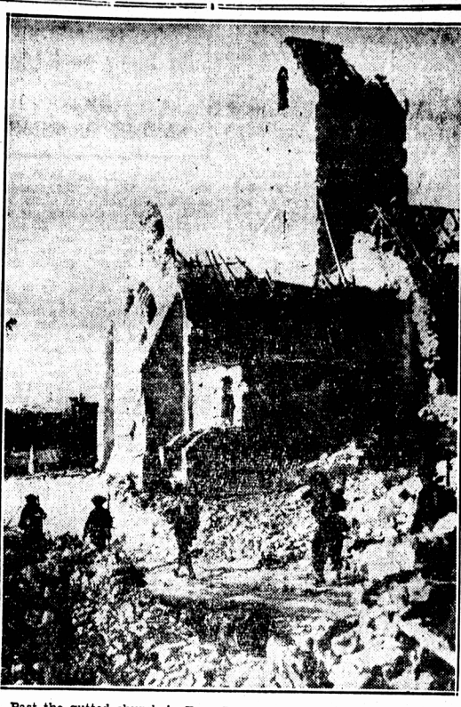
Past the gutted church in Bons Tassilly, men of a French Canadian unit advance down the road to Falaise.