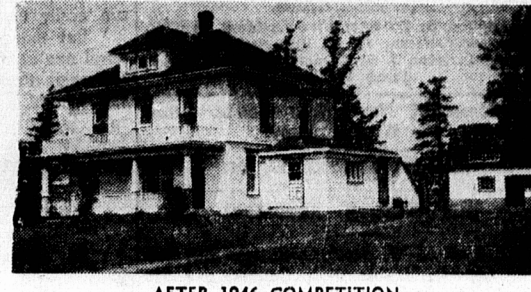
AFTER 1946 COMPETITION