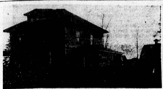
BEFORE 1946 COMPETITION