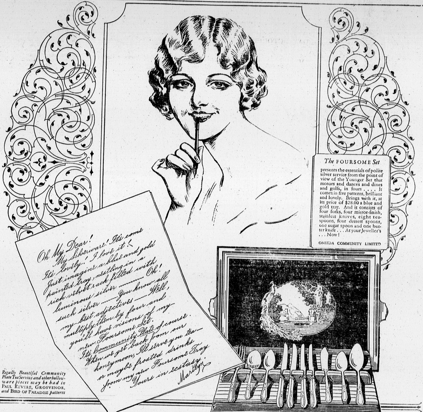
Regally Beautiful Community Plate Services and other brilliant ware pieces may be had in PAUL REVERE, GROSVENOR, and BIRD OF PARADISE patterns

Oh My Dear! My Sister! It's come! It's lovely! I love it! Just imagine a blue and gold painted tray, resting in a rich velvet sack filled with luminous silver. Oh! such silver! You know all my best adjectives. Well, multiply them by four and you'll have visions of my new Foursome Set. It's Community Plate of course. When we get back from our honeymoon, I'll serve you tea on my new Foursome Tray. Yours in ecstasy, Marjorie