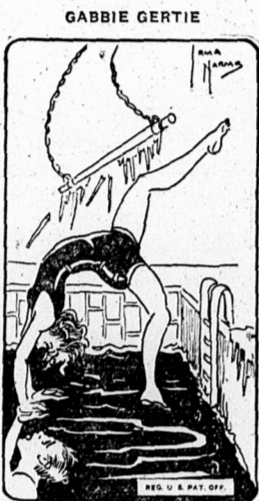
"Frosting water-tumbler is a simple process when the temperature is low."