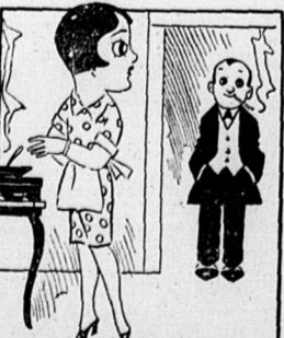
Mrs. Justwed: Gerald, will you do me a favor, dearest? Mr. Justwed: What is it, Lovey? Mrs. Justwed: Look in the cook book and find how long it takes to boil fried potatoes.