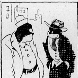
"So yo' wants to marry mah daughter, eh? Can yo' support a wife, young man?"