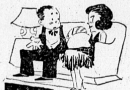
He: I proposed to her last night. She said "no" and I said "good night!"