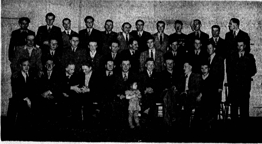
Above are groups of "new Canadians" from European countries who are seeking to shape a new life in this country. The groups pictured above are representative of those receiving an introduction into the Canadian way of life in this Province. They are pictured at a recent party sponsored by the Klansmen Club through the Citizenship Council.