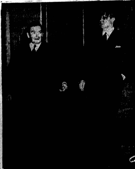
PREMIERS DUPLESSIS AND DREW