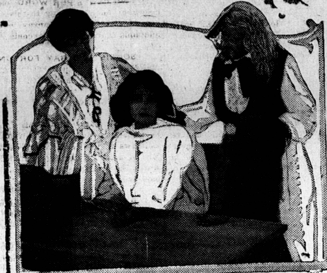
Jo sells her hair. Wm. A. Brady presents "LITTLE WOMEN" Dramatic Adaptation