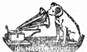
Victor Talking Machine Company of Canada Limited