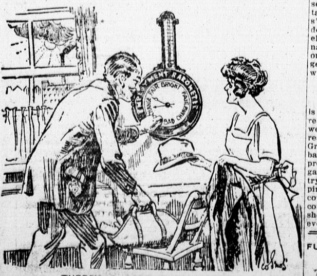
THERE'S A GOOD TIME COMING Reports from Great Britain indicate a reduction in unemployment in about six weeks of a hundred and four thousand.

THE WHITE ROSE TENTURE The condition has not always been easy to fulfill. Queen Victoria and the prince escort once states are held upon curious tenures visited Blair Athol in winter, and a notable instance being Blair Athol the necessary roses had to be obtained from the Duke of Athol on the condition that a white rose should be presented to the sovereign on milder. Within recent years roses the occasion of every royal visit. have been seen growing in Aberdeen gardens in December.