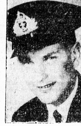
IN WRECKING EXPLOIT