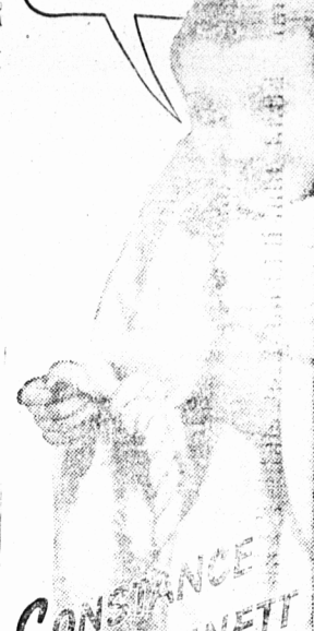
CONSERVED BENNETT COLUMBIA PICTURES STAR

This lovely start tells you how to make your skin daintiness. A delicate Toilet Soap because it is wonderfully refreshing and you'll love the clinging fragrance of rich Whipped Cream Lather. Leaves on your skin a soft, smooth glow. Try it for yourself!