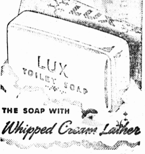
THE SOAP WITH Whipped Cream Lather

This lovely start tells you how to make your skin daintiness. A delicate Toilet Soap because it is wonderfully refreshing and you'll love the clinging fragrance of rich Whipped Cream Lather. Leaves on your skin a soft, smooth glow. Try it for yourself!