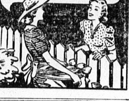
CONFEDERATION LIFE INSURANCE L-9789-7-21-311