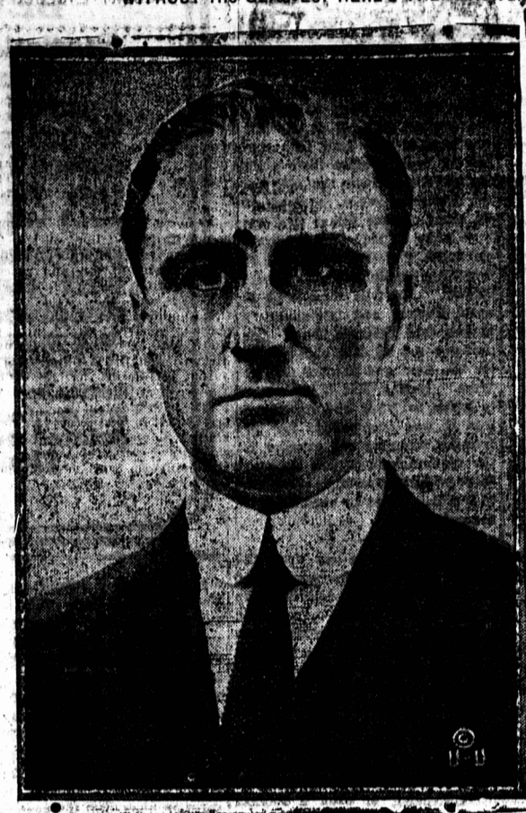
Franklin D. Roosevelt. This photograph showing the Assistant of the Navy without "cheating" Democratic nominee for the vice-presidency, look without his glasses? That question has been asked often. It is answered here.